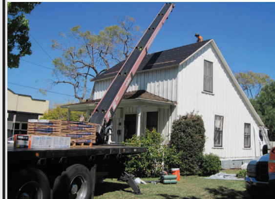
Testa workers begin to tear off old roof

Working to make yesterday's resources part of tomorrow's history.